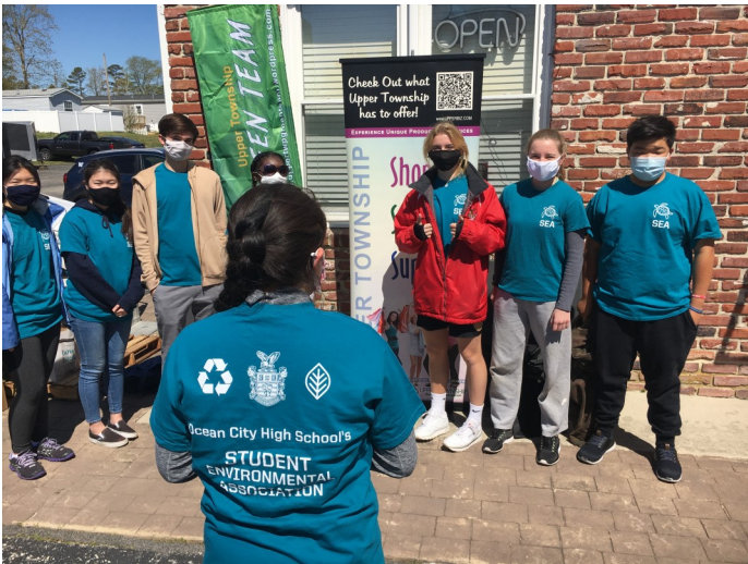
OCHS SEA Student Volunteers at Shredding Truck Event for Upper Twp. Our thanks to the students with the Ocean City High School Student Environmental Association (SEA) that volunteered for our annual Shredding Truck Event