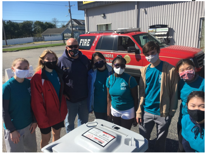
with our Upper Twp. Business Association (UTBA) and Upper Twp. Sustainable Jersey Green Team on Saturday, May 1, 2021. ##