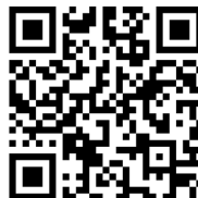
QR for > Facebook.com/UpperTwpGreenTeam

Working toward a more sustainable Upper Township